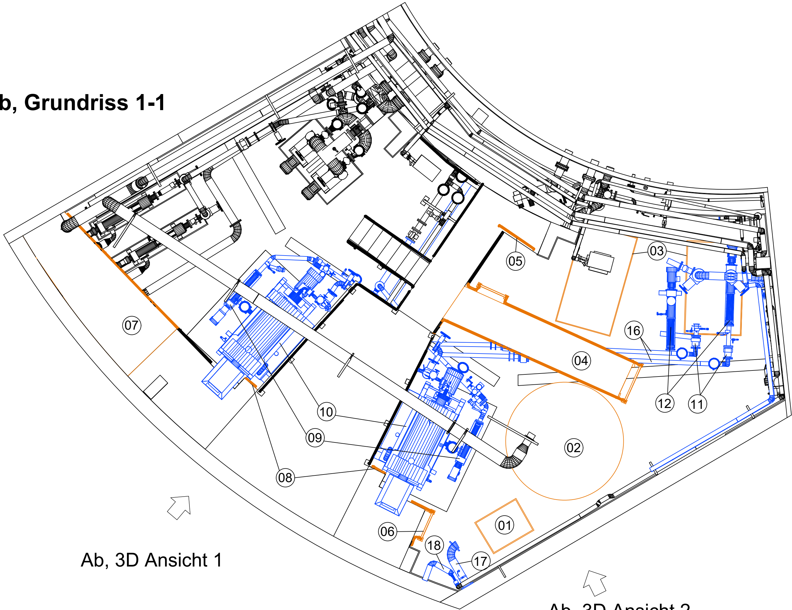
Ab, 3D Ansicht 1